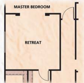
OPT. D RETREAT