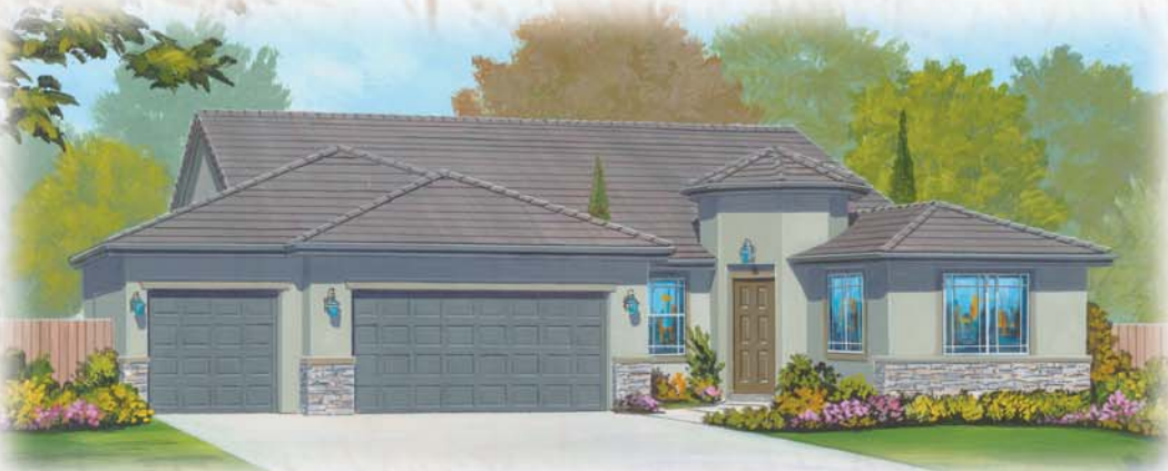
ELEVATION C, modeled