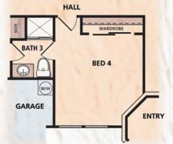
OPT. E BEDROOM #4 & BATH #3