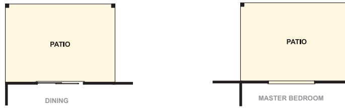
Optional Patio 1