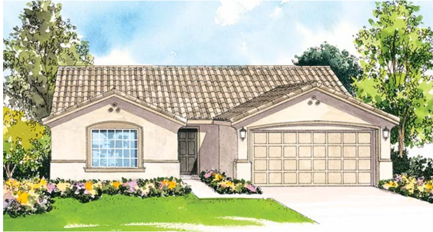
elevation 2A (model)