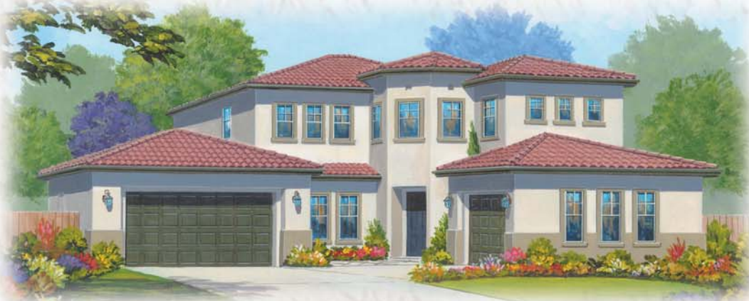
ELEVATION A, modeled

3-5 Bedrooms, 2 1/2 -4 Baths 3,140 sq. feet