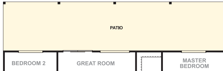
Optional Patio 3

3 bedrooms • 2 bathrooms 1,251 square feet • 2-car garage Optional Patios