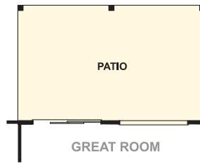
Optional Patio 1