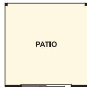
Optional Patio 2