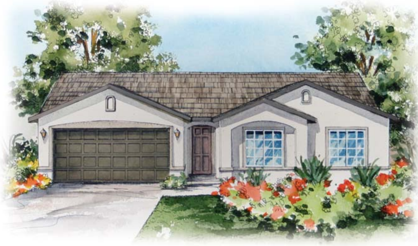
elevation 1A (model)