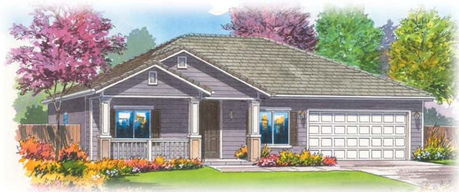
ELEVATION B, Modeled