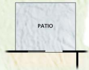
OPT. C PATIO