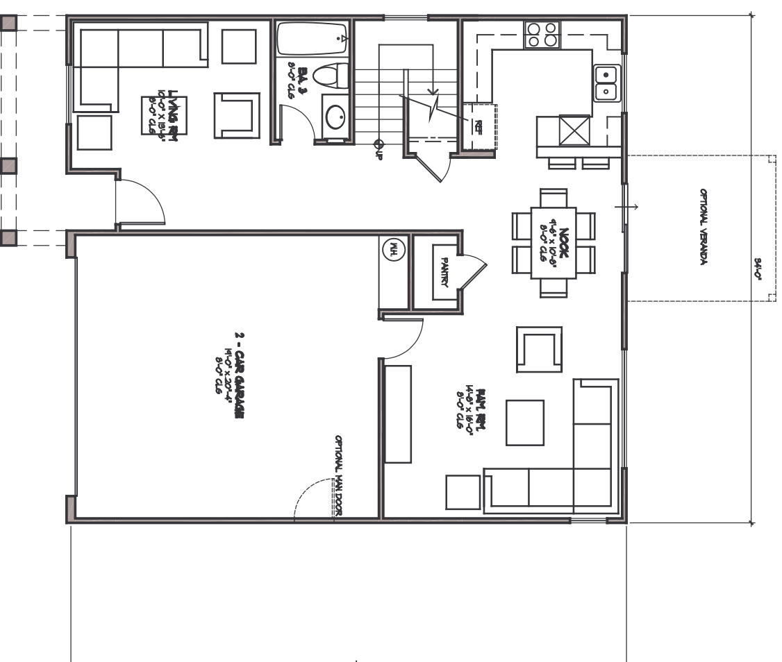
FIRST FLOOR PLAN SCALE: 1/4" = 1'-0" ELEVATION B FIRST FLOOR PLAN, 848 SQ. FT. SECOND FLOOR PLAN, 944 SQ. FT. TOTAL, 1,792 SQ. FT.