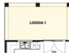
Optional Loggia 1 off Nook