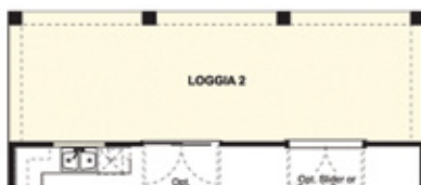
Optional Loggia 2 off Great Room