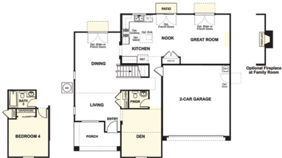
Optional Bedroom 4 at Den