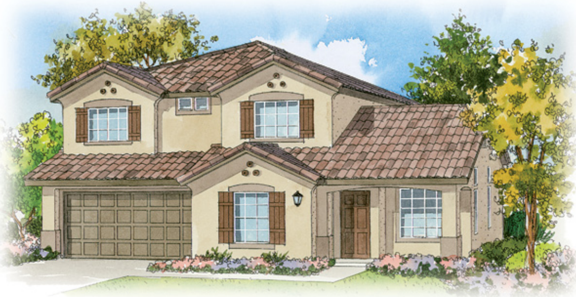
3B reverse (model 2)