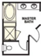
Optional Shower at Master Bath

Two-Story ■ 3 - 4 Bedrooms ■ 2.5 - 3 Baths Optional Den ■ 2-Car Garage ■ 2,112 Square Feet